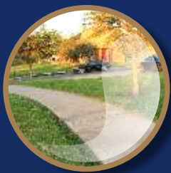
3. Walking Trails