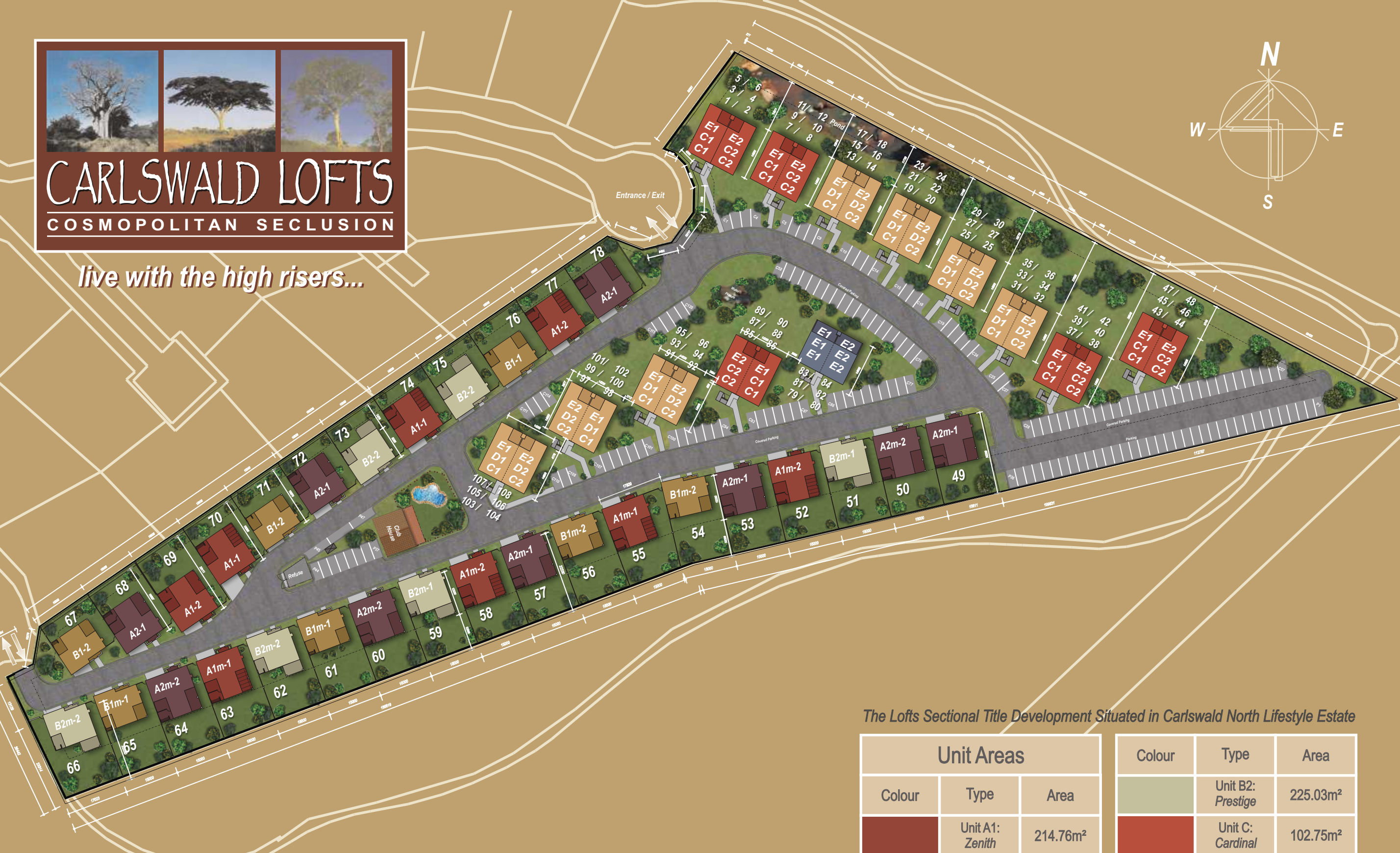
The Lofts Sectional Title Development Situated in Carlswald North Lifestyle Estate